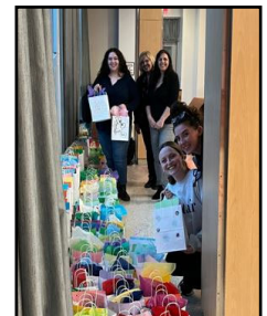
More than 200 Goodie Bags were made containing a coloring book, toys, and a handwritten note from WP Honors students.