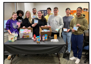
Student volunteers in the February and March sandwich making sessions