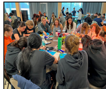
Over 60 students attended the Goodie Bag making event in early April