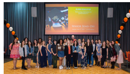
Many Honors students attended the Senior Send-Off event on 5/17.