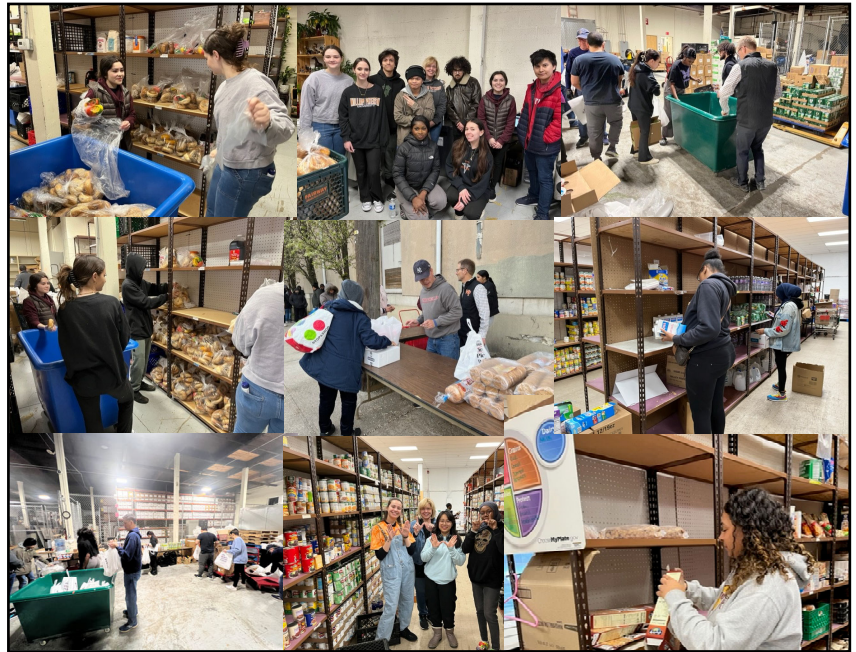
WP Honors volunteers working hard at the Father English Community Center in Paterson.